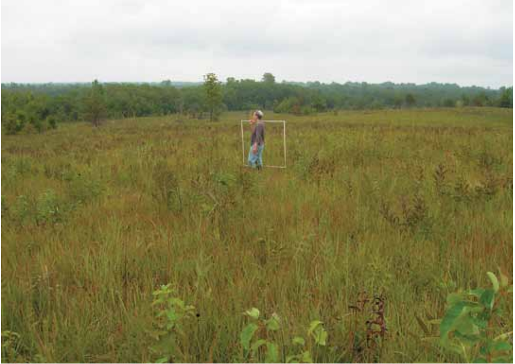
FIG. 1. Blackland prairie: Grandview One.

1) Saratoga Blackland Prairie Natural Area: Howard Co. 33°45'27.76"N 93°54'56.10"W. Elevation 119 m. Demopolis/Sumpter soil series (Hoelscher et al. 1975). Owned and managed by Arkansas Natural Heritage Commission, acquired in 2004.